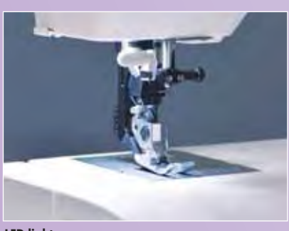
Long lasting light source that illuminates your sewing projects with a crisp light.