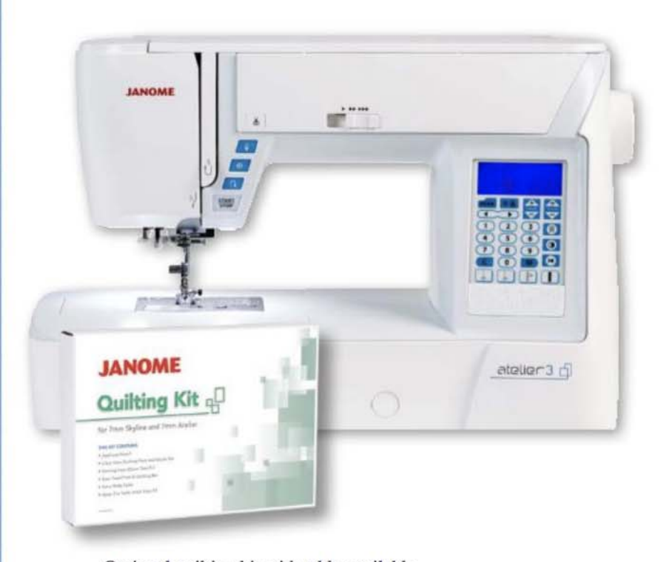
Optional quilting kit with table available