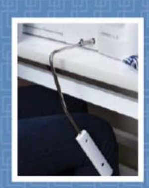
ERGONOMIC KNEE LIFT