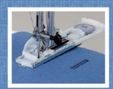
AUTOMATIC 1 STEP BUTTONHOLE