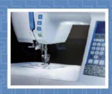
ULTRA-BRIGHT LED LIGHTS