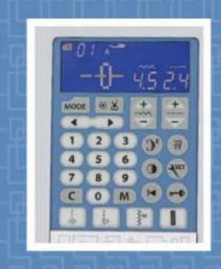
STITCH SELECTION KEYPAD