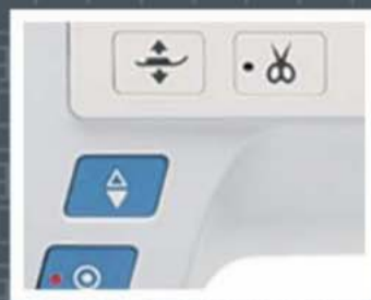
AUTOMATIC PRESSER FOOT LIFT

Optional Crafting and Home Décor, Quilting, and Fashion and Finishing kits available