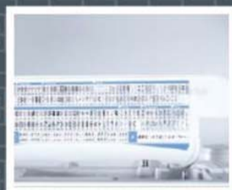
240 BUILT-IN STITCHES