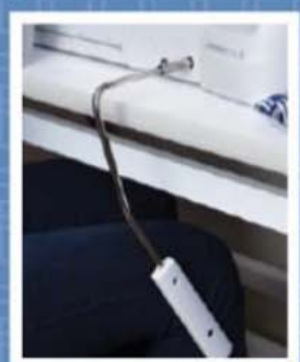
ERGONOMIC KNEE LIFT