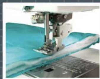
ACUFEED FLEX LAYERED FABRIC FEEDING SYSTEM