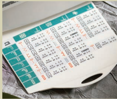
Need advice? Reach for your Sewing Guide Reference Chart! Your EMERALD™ features a simplified Sewing Guide Reference Chart that helps with the right settings. Pull it out from the base of the machine.

EMERALD™ 118 creates 70 stitch functions.