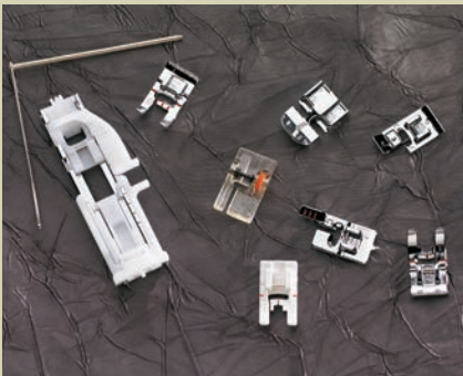
Presser feet EMERALD™ 118 and 116: Utility foot A, Decorative foot B, Buttonhole foot, Adjustable Blind Hem foot, Zipper foot E, Non Stick Glide foot H, Edging foot J, Edge/Quilting Guide, Automatic Buttonhole foot.