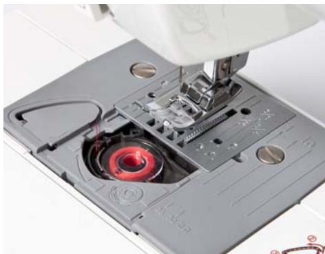
Quick set bobbin – just drop in a full bobbin and you are ready to sew