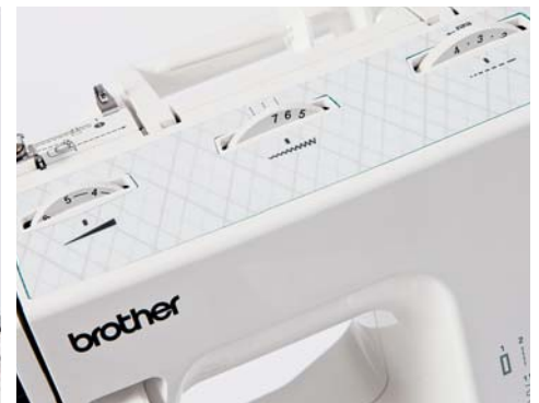
Stitch length and width adjustment

For more informations see your dealer or visit www.brothersewing.eu .