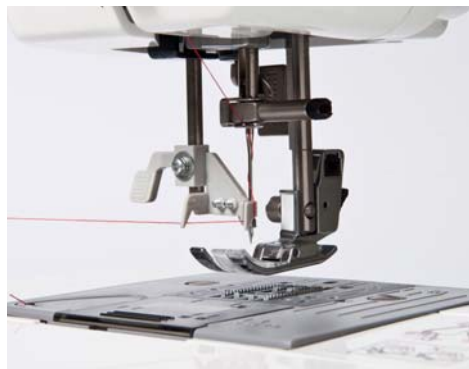
Easy automatic needle threading