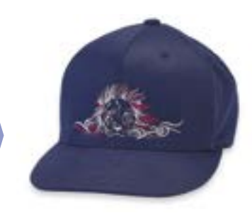
FLAT BRIM CAP FRAME