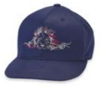
REGULAR CAP FRAME

More than 20 additional accessories available for specialized embroidery!