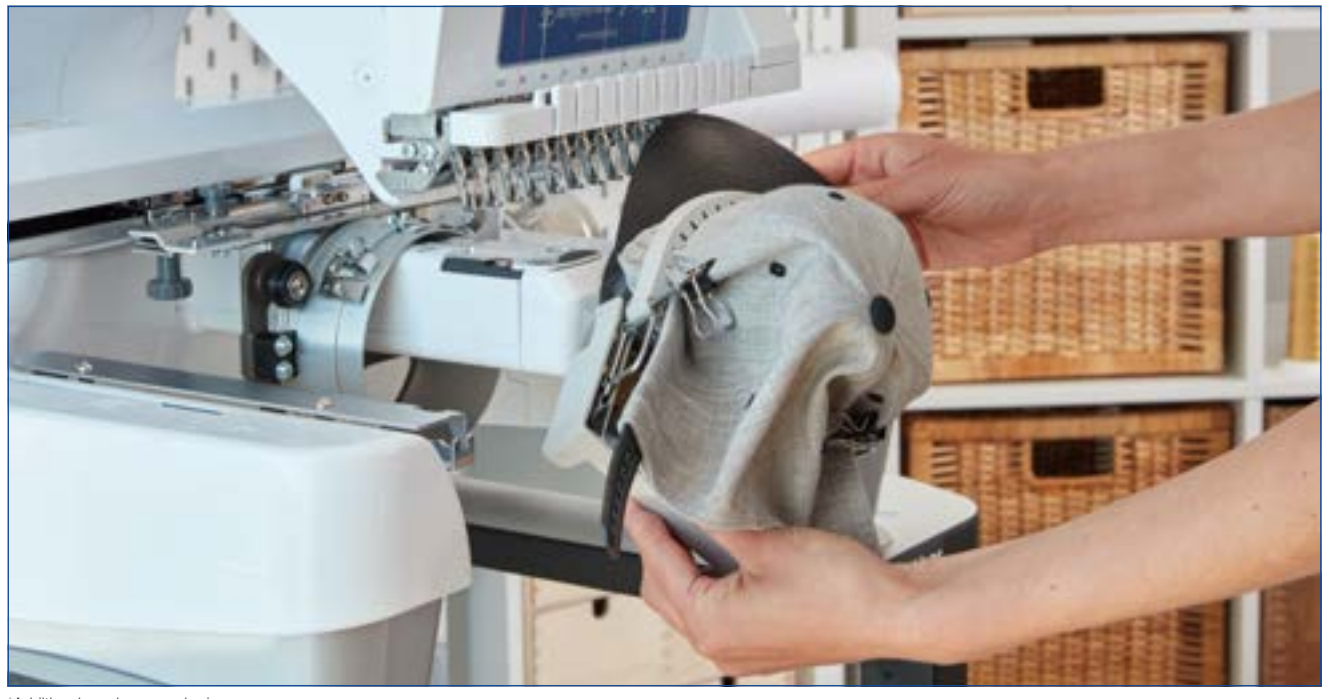
*Additional purchase required

Embroider more types of hats than before with the easy-to-use 'scratch-free' cap frame. You can stitch an industry leading 35% closer to the brim (6-10mm), depending on the cap.