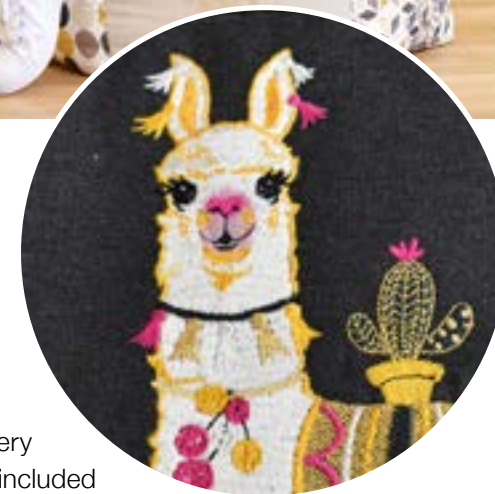
Variety embroidery designs included