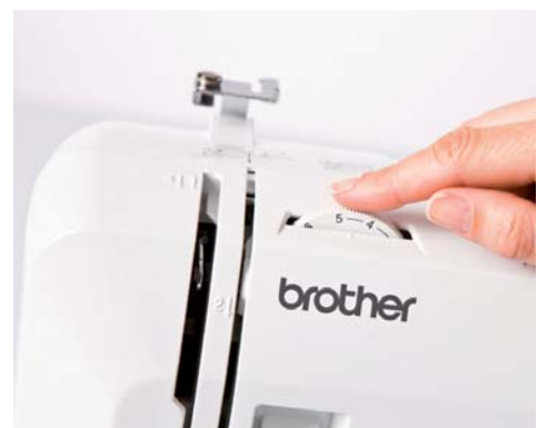
Stitch tension adjustment

For more informations see your dealer or visit www.brothersewing.eu .