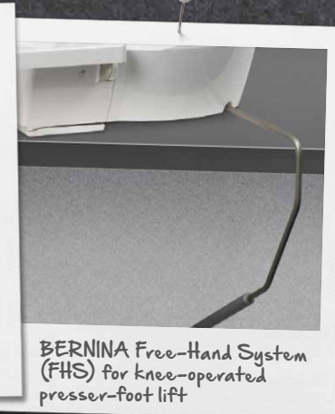
BERNINA Free-Hand System (FHS) for knee-operated presser-foot lift