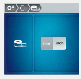
Toggle between mm & Inches The embroidery design size and the hoop dimensions can be shown in mm or inches.

Embroidery Consultant The consultant helps you to choose the correct foot, needle, thread and stabilizer according to your fabric to achieve the best results.*