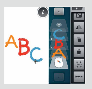
Group & Ungroup Combine designs into a Group to edit all at one time. Ungroup easily to edit designs individually.