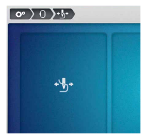
Thread Away Mode

Pulls the threads to the underside for clean embroidery results on the top. Program jump stitch length to manage thread cuts. Subject to design properties.