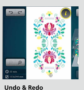
Simply undo or redo steps while editing or combining designs to return to your initial position (B 790 PLUS only).