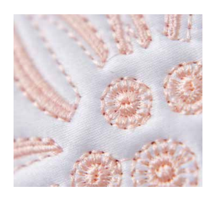
Invisible & Smart Secure Securing stitches become invisible as the tie-on/off stitches are sewn in stitch direction. Smart secure adds tie-on/off stitches to a design, if none are preset.