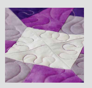
Quilting in the Hoop Unique, built-in design collection, complete with beautifully patterned quilt blocks and continuous line quilting designs all done in embroidery (B 770 QE PLUS only).