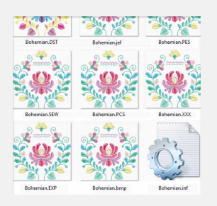
Read Multiple Formats Read most popular file formats: EXP, DST, PES, PEC, JEF, SEW, PCS, XXX.