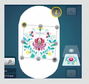
Pinpoint Placement Place your design on the fabric exactly where you want it. No need to use the template anymore. Use the new lock function (B 770 QE PLUS/ B 735 only) to maintain the embroidery design size during the positioning.