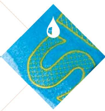
2. Film residues easily dissolve in water.