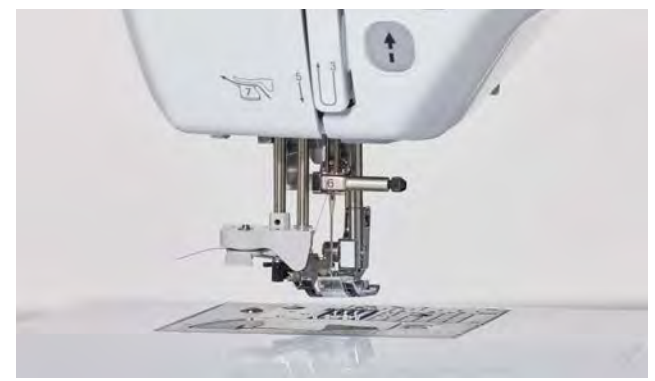
Advanced needle threader