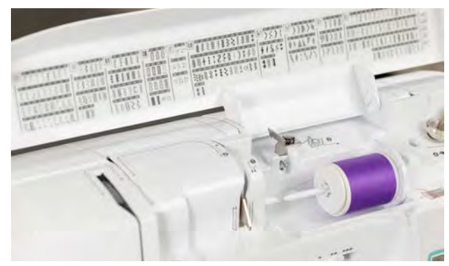
241 built-in sewing and decorative stitches