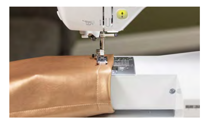
Free arm sewing