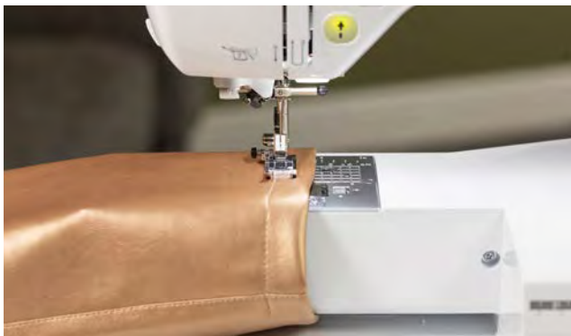
Free arm sewing