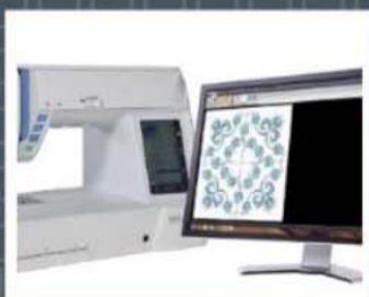
STITCH COMPOSER STITCH CREATION PROGRAM