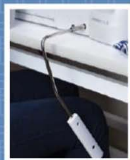
ERGONOMIC KNEE LIFT