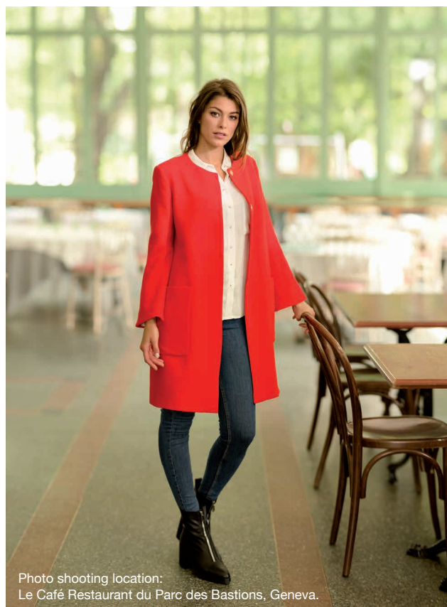
Photo shooting location: Le Café Restaurant du Parc des Bastions, Geneva.

No matter if decorative or functional, you will appreciate the precision and regular quality of all the stitches. With the 570, you can also create personal and unique stitch combinations.